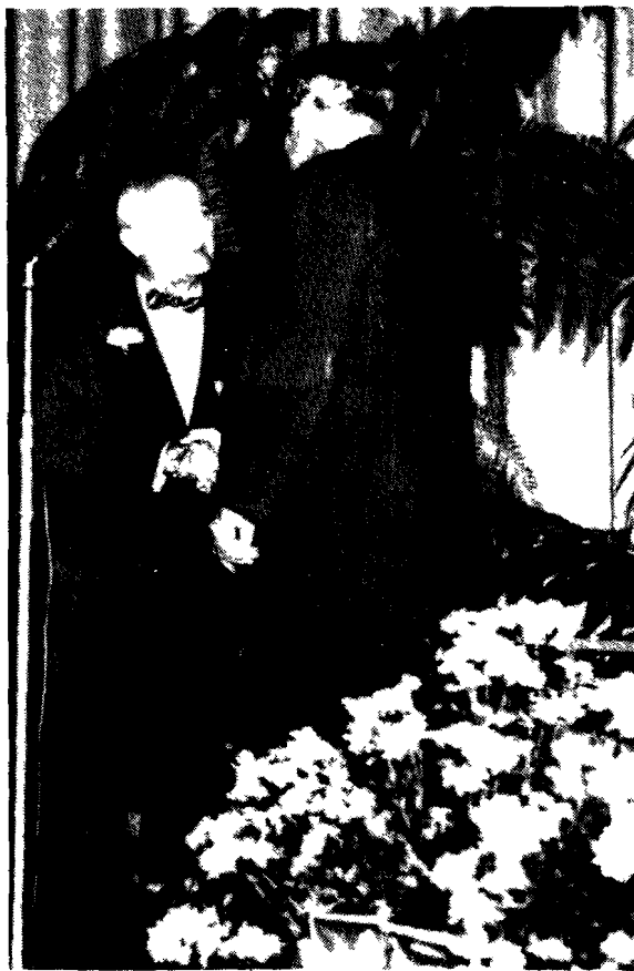
Mr. Friedman receiving the National Security Medal from Mr. Allen Dulles, Director of Central Intelligence

His inventions and many achievements won for Mr Friedman the nation's highest awards and a reputation as one of the world's leading cryptologists. In 1944 he was presented the War Department's highest decoration the